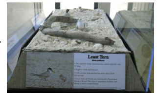
3rd floor Least Tern Exhibit